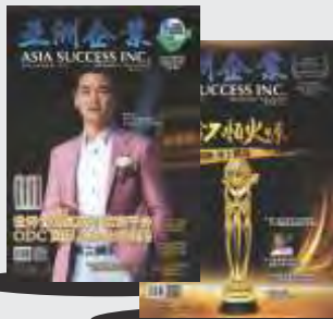
Asia Success Inc. Branding Magazine