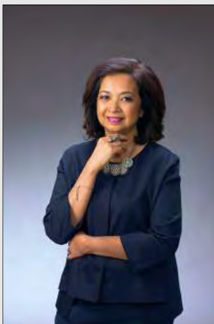
Datin Paduka Ms Marina Mahathir Guest of Honour & Keynote Speaker

Datin Paduka Ms Marina Mahathir is a socio-political activist and writer, focussing on the intersection of gender, religion and politics. She is a leader in many non-governmental organizations such as the Malaysian AIDS Foundation and is an active socio-political blogger.