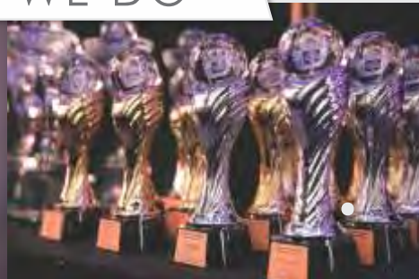
Co-organiser of Most Impactful Awards