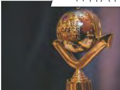
Co-organiser of Asia Success Award